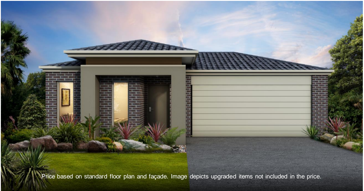
Price based on standard floor plan and façade. Image depicts upgraded items not included in the price.