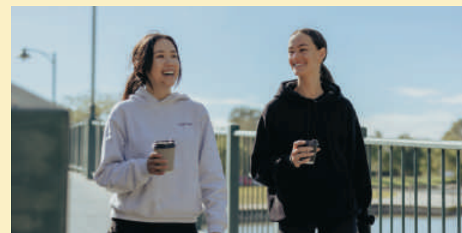
Enjoy a balanced lifestyle with ample walking trails in and around the central lakes.