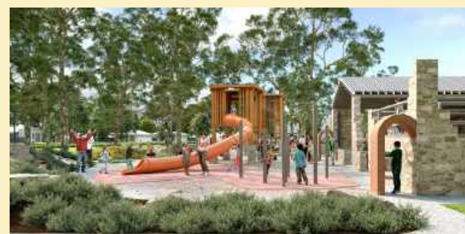
Artist Impression of nearby playground and park, located within the Display Park.