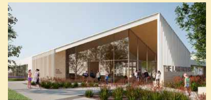
Artist Impression of The Lakehouse, located on the entry to Highgrove.